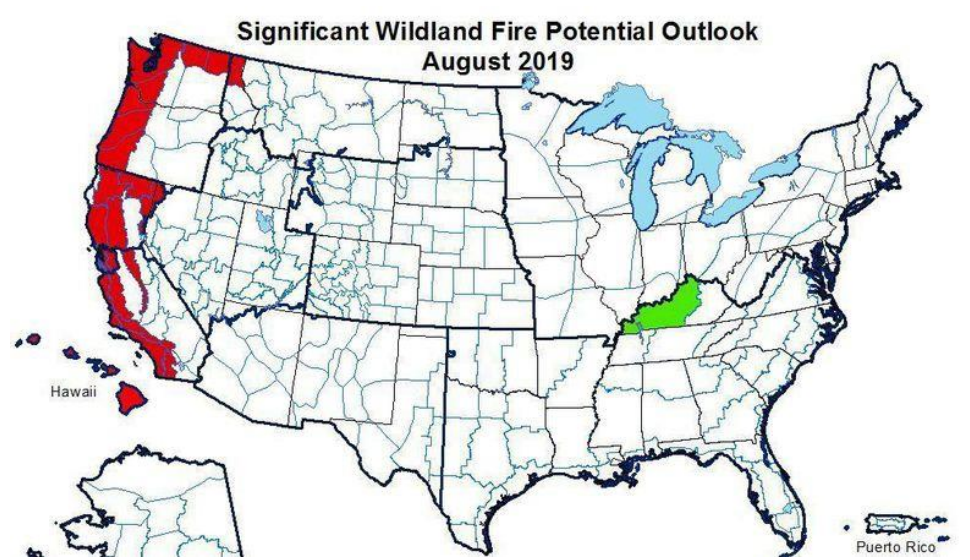
California and the west coast have heightened wildfire risk this summer

The study said cooler temperatures could help Southern California during its fire season.