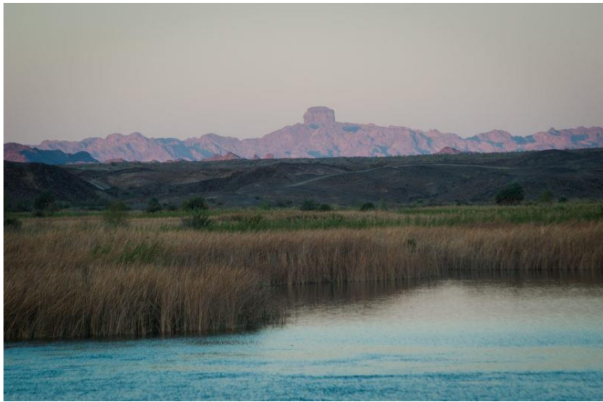
The Imperial Valley has more rights to water from the Colorado River than entire states. Here, at the Imperial Dam, it's sent to the valley. Now, investors may want to make money by sending the water elsewhere.

In the past several years, Los Angeles-based Renewable Resources Group has helped sell 33,000 acres of land to California's most powerful water agency, the Metropolitan Water District of Southern California. Documents obtained by VOSD raise fresh questions about those deals. Now, Renewable may be working on another deal that could rearrange the distribution of water in California forever.