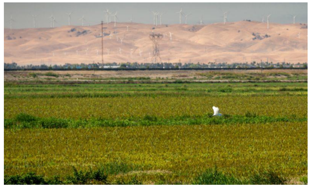
Corn fields on Bacon Island, one of the inland islands the Metropolitan Water District bought for $175 million.